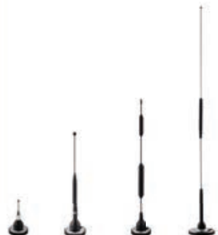
2 inch 11 inch 14 inch 26 inch Available Omni Directional Antenna Mast Sizes

SmoothTalker is the largest maker of universal and custom powered cradles in North America. These cradles are designed to connect to our boosters and hands free kits and are industrial quality. These powered cradles work as a system and tuned with our boosters providing the best possible "iPhone or Samsung or BlackBerry" mobile cellular experience. No one else in the market offers this kind of package.