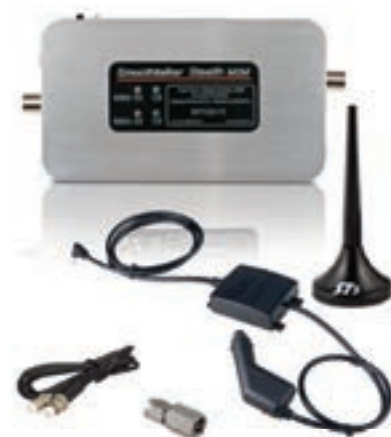
Typical Plug and Play Kit